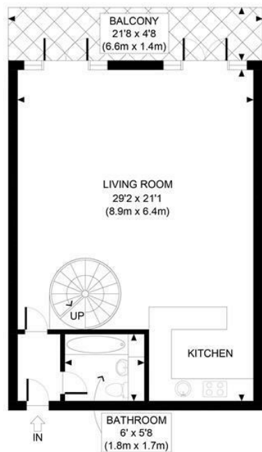
THIRD FLOOR GROSS INTERNAL FLOOR AREA 625 SQ FT